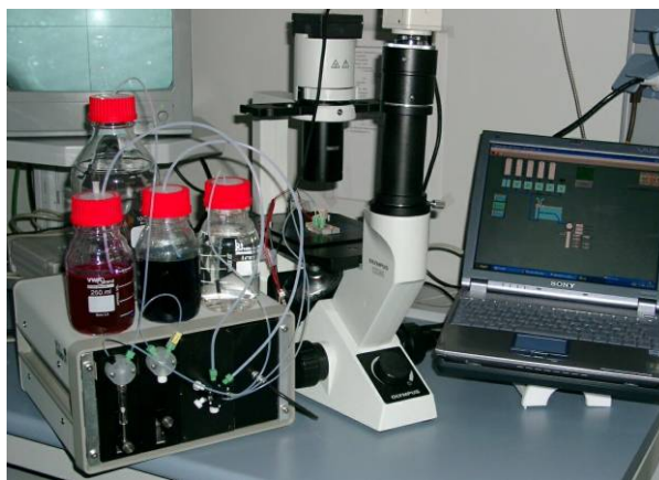
GeSiM syringe pumps in real life: two-channel dilutor with selector valve for the fluidic control of the GeSiM mini-flowthrough cell for the microscope ("MicCell"), including Windows control software

Supply voltage: 24 V DC (produced by external or internal power supply included in the shipment)