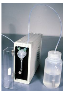
Left: one-channel syringe pump with tubing