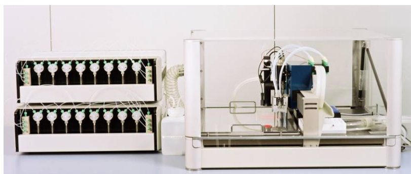
Below: micropipetting system Nano-Plotter™ NP 2 with 16 channels, connected with two 8-dilutor units that control the fluidics