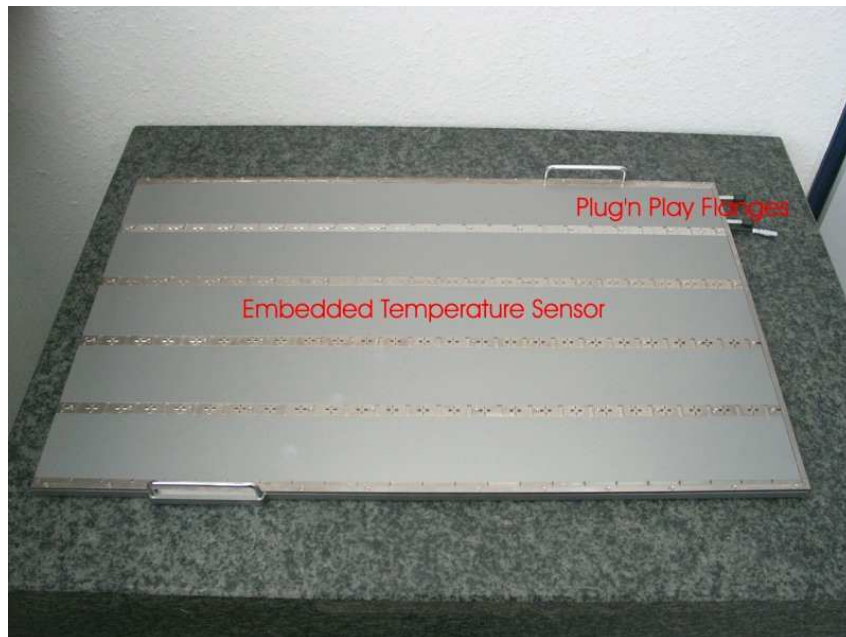
Figure 2. The removable slide deck can be easily released from the tubes of the thermostat (e.g., for loading/unloading). The one shown here, an extended one, is used in the Nano-Plotter NP 2.0/E, and contains small (removable) knobs to align the slides.

The temperature of the slide deck does not change when the lid is opened.